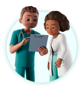
Goal-Setting & Tracker Sheets